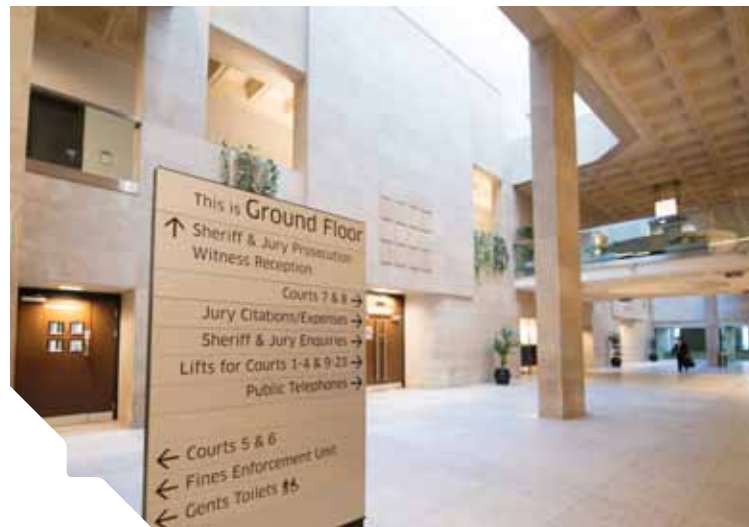
Well managed estate