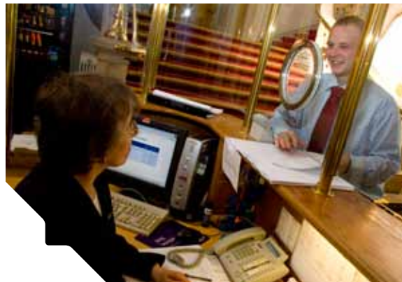
Aberdeen Sheriff and JP Court