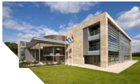
West Lothian Civic Centre