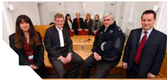
Justice partners, Alloa