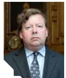
Lord Carloway, Lord Justice Clerk, Criminal Law Conference, May 2013