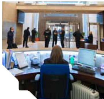
Glasgow – Scotland's busiest court