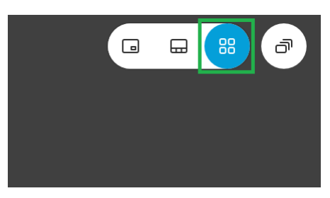
Figure 4 - Button to change to Grid View