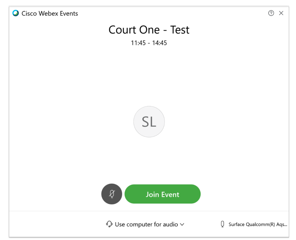
Figure 2 - Event entry window

This will launch the Events session, which after a moment will present with the ability to join the Event, with a green Join Event button.